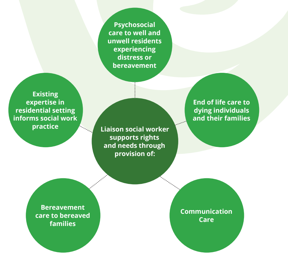
Figure 1: Framework for Liaison Social Work Role

Acting as a consistent point of contact between the residential care setting, individuals and families, the liaison social worker provides systemic assessment and intervention to residents in care settings who may have limited/no visits from family, including very unwell and dying individuals and to the bereaved relatives of those who die in care settings. It also includes the provision of support to residents distressed by death or infection rates in their community. The liaison social worker provides purposeful practical assistance as required to support emotional and social well-being. Key responsibilities of the role are outlined in Appendix A.