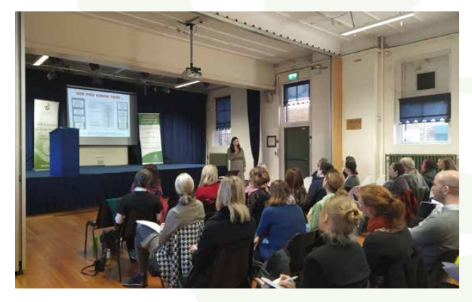
'Understanding ACEs for a Social Work Perspective' Event October 2019